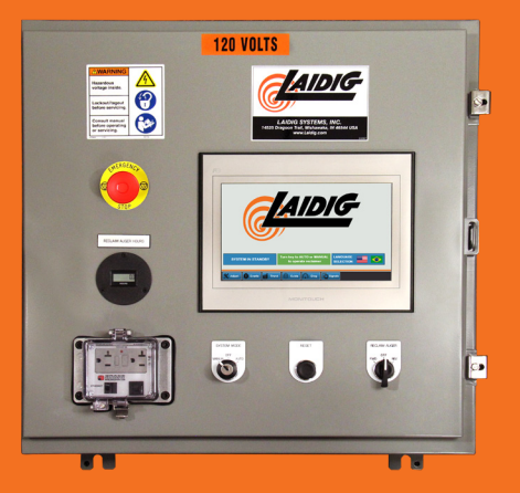
*All Laidig LMI's are custom engineered to each reclaim system. UL has tested representative samples and determined they meet the specific, defined requirements based on UL's published and nationally recognized standards for safety.

The Laidig Fluidized Screw offers intelligent, fully-automated, pushbutton operation utilizing Laidig's LMI<sup>™</sup> (Laidig Machine Interface). The LMI provides the operator with maximum control and flexibility while ensuring the reclaimer is running in a safe and efficient manner. It allows the operation and monitoring of the reclaimer's status in a graphic-rich display. The LMI provides an interface to safely control the Fluidized Screw reclaim system, which can be integrated with various types of customer control systems. It can also include remote access capability for monitoring or troubleshooting the system off-site.